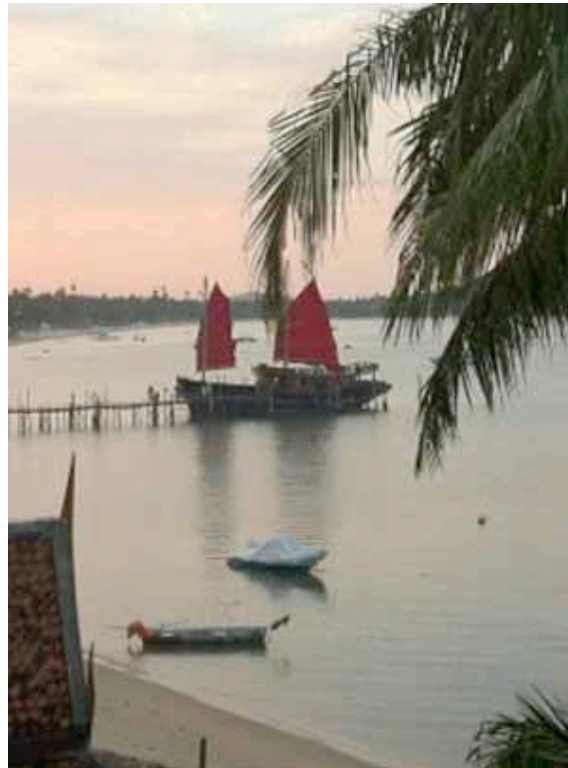
View of the harbour

The interior of the property is a tasteful extension of the exterior, with white walls, plantation shutters and the rich texture of recycled teak floors. Visually stunning, comfortable and evoking a feeling of yesteryear, Villa M is the perfect place to relax. Five stylish double bedrooms with crisp white linen, individual ensuite bathrooms with the latest fixtures and fittings, a modern designer kitchen, a study which offers a quiet place to read novels from the library, two separate living rooms with plush sofas and beach front views, and balconies complete with Burmese plantation chairs from which you can watch the magnificent sunsets through swaying palm trees.