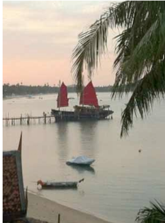
View of the harbour

“In furnishings, we have been inspired by memories of the colonial homes we loved as children growing up in Asia,” adds Leslie. “We were also influenced by cherished stays at The Oriental Hotel, Bangkok as well as the Strand, Yangon, and Raffles, Singapore. We paid particular attention to detail and sourced some wonderful furniture and antiques from all over Thailand and the east. We also added special pieces and memorabilia from our private collection.”