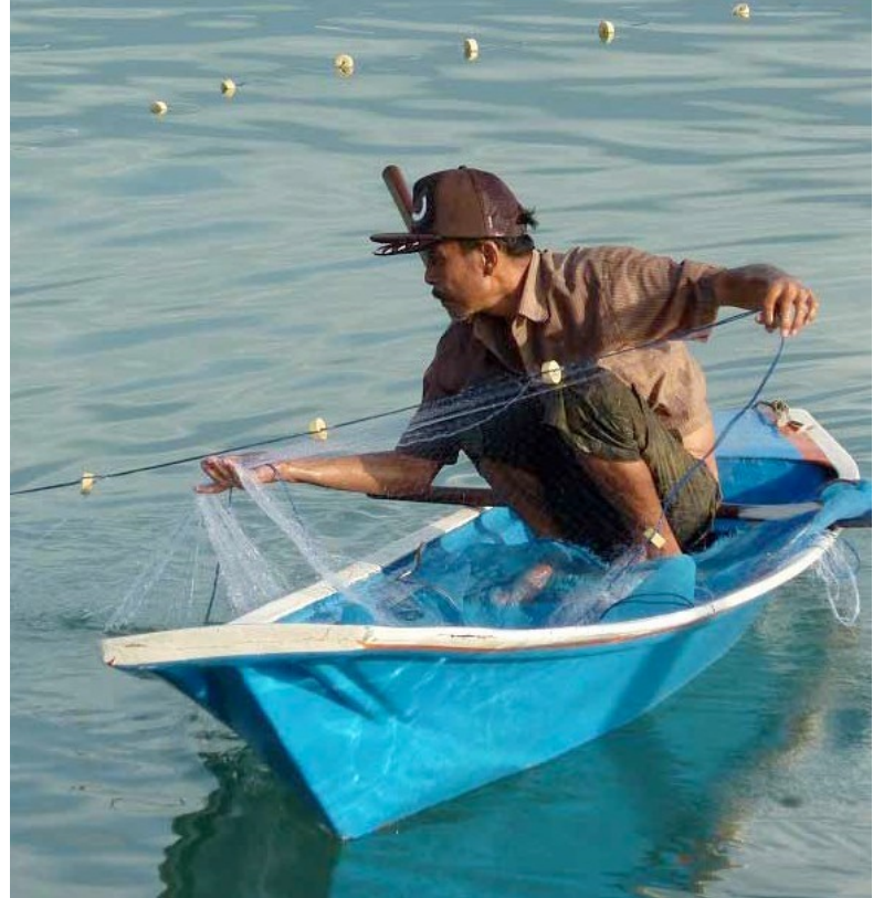
Villa M Fisherman's Village